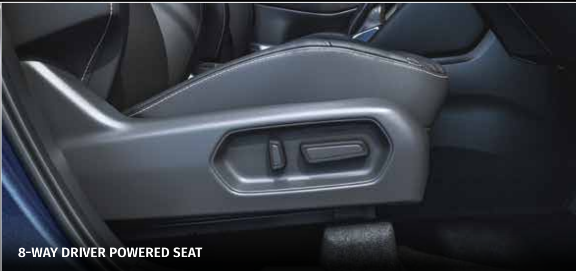
8-WAY DRIVER POWERED SEAT