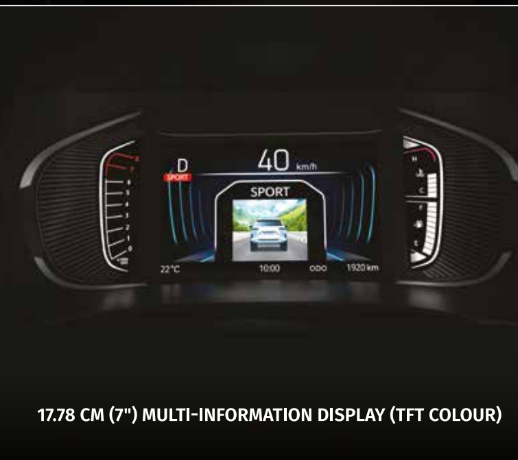
17.78 CM (7") MULTI-INFORMATION DISPLAY (TFT COLOUR)