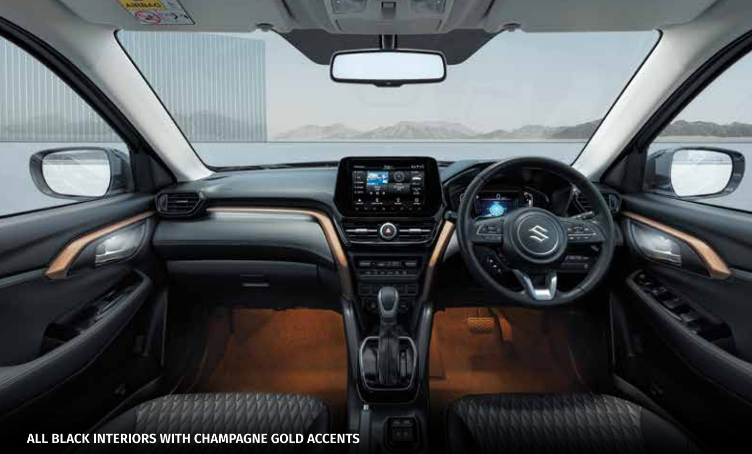
ALL BLACK INTERIORS WITH CHAMPAGNE GOLD ACCENTS