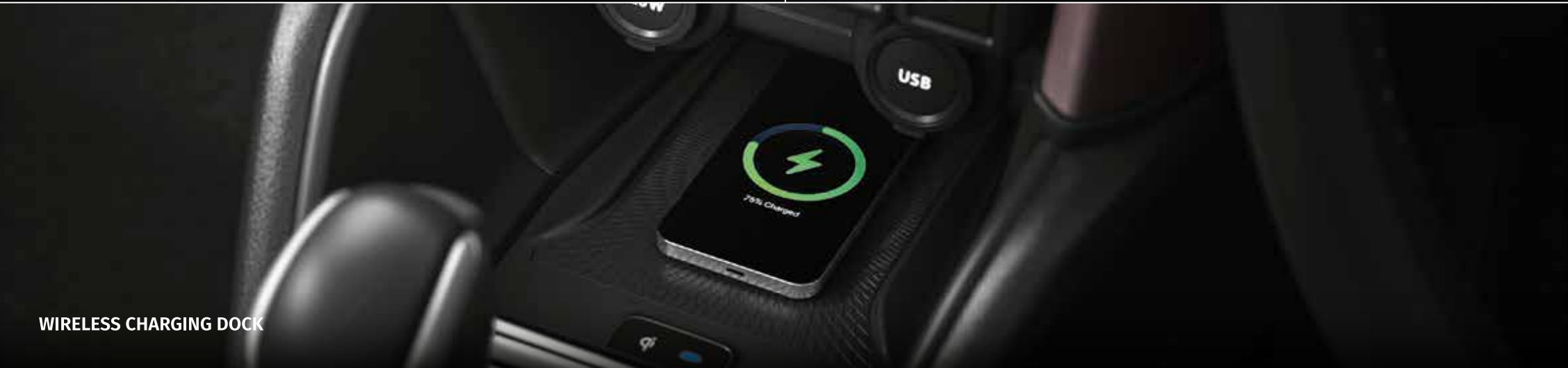
WIRELESS CHARGING DOCK