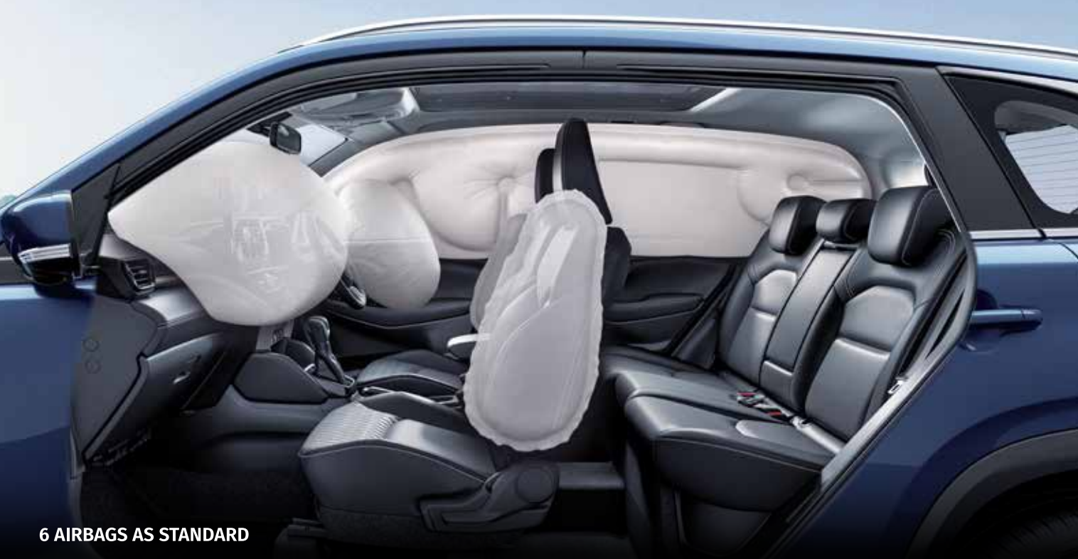
6 AIRBAGS AS STANDARD