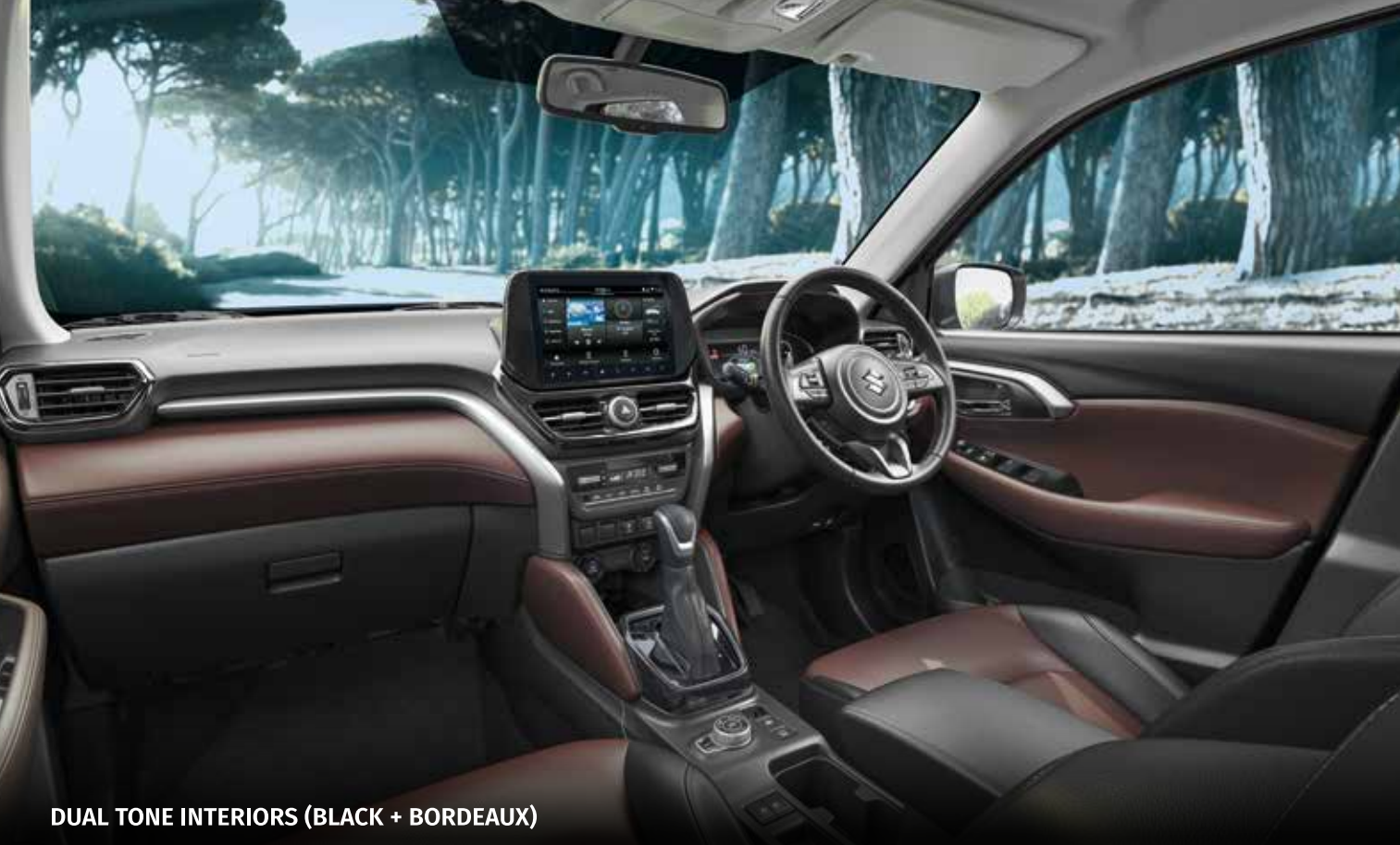
DUAL TONE INTERIORS (BLACK + BORDEAUX)