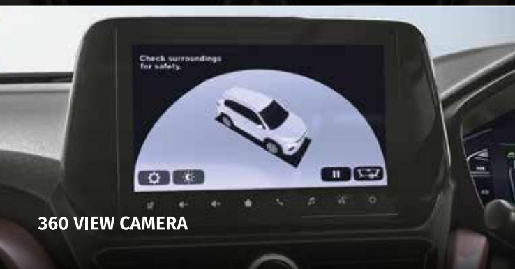
360 VIEW CAMERA