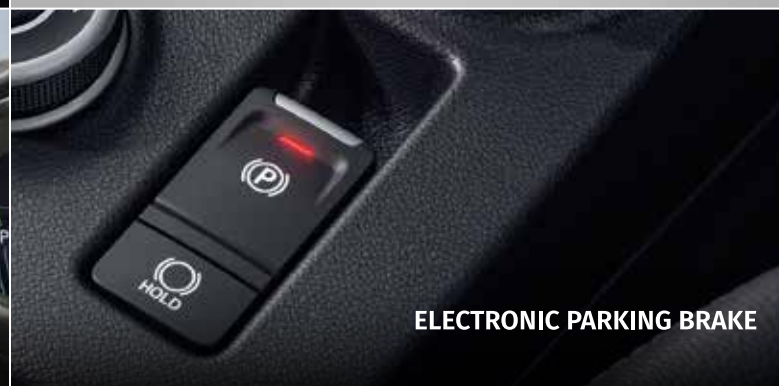
ELECTRONIC PARKING BRAKE