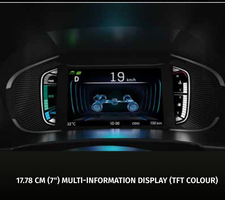
17.8 CM (7") MULTI-INFORMATION DISPLAY (TFT COLOUR)