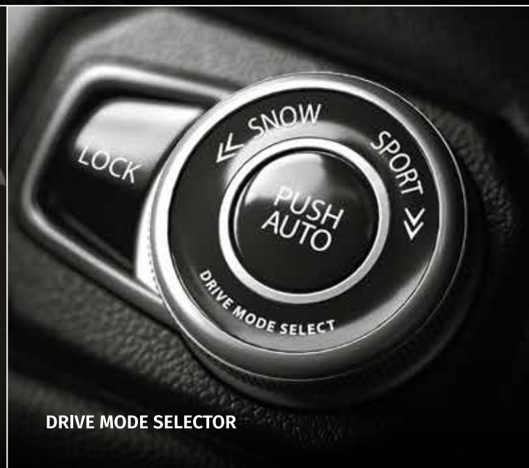
DRIVE MODE SELECTOR