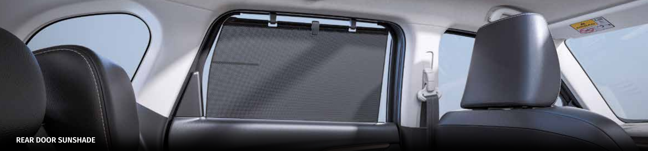
REAR DOOR SUNSHADE