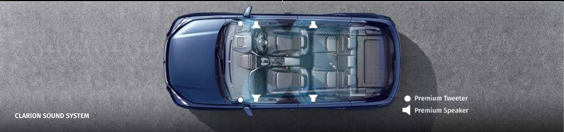
CLARION SOUND SYSTEM