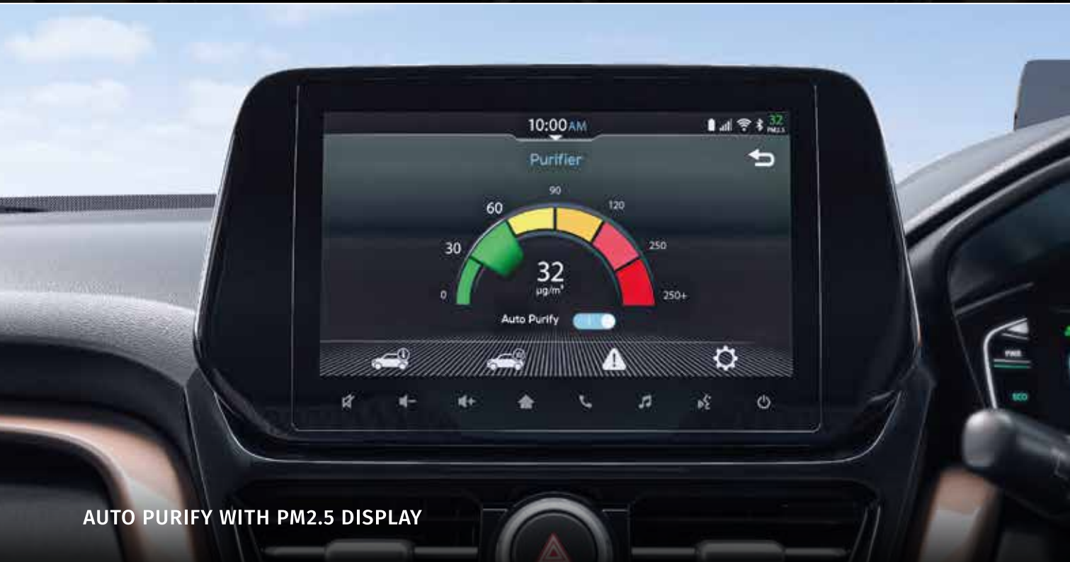
AUTO PURIFY WITH PM2.5 DISPLAY