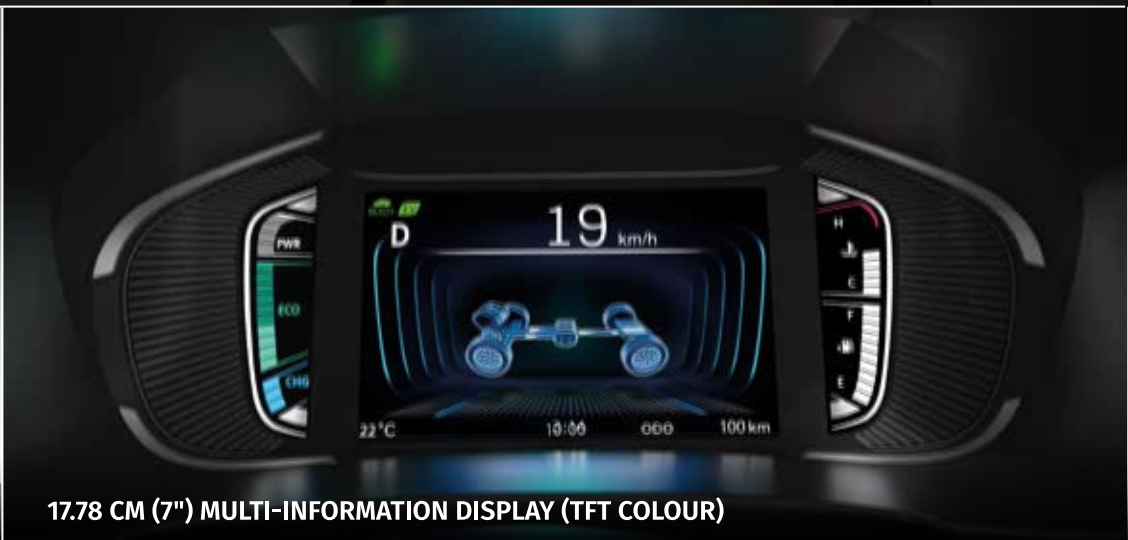
17.78 CM (7") MULTI-INFORMATION DISPLAY (TFT COLOUR)