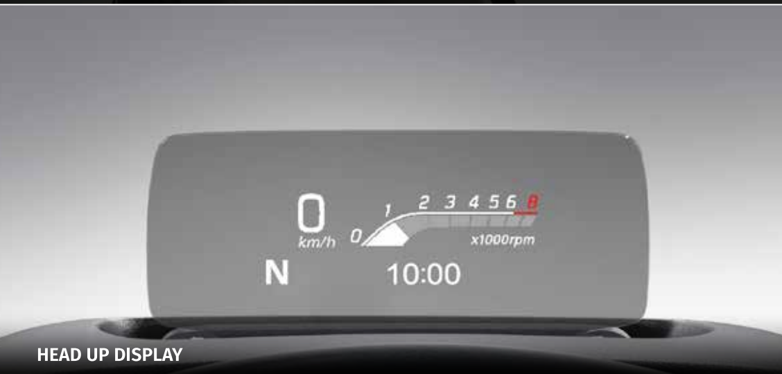
HEAD UP DISPLAY