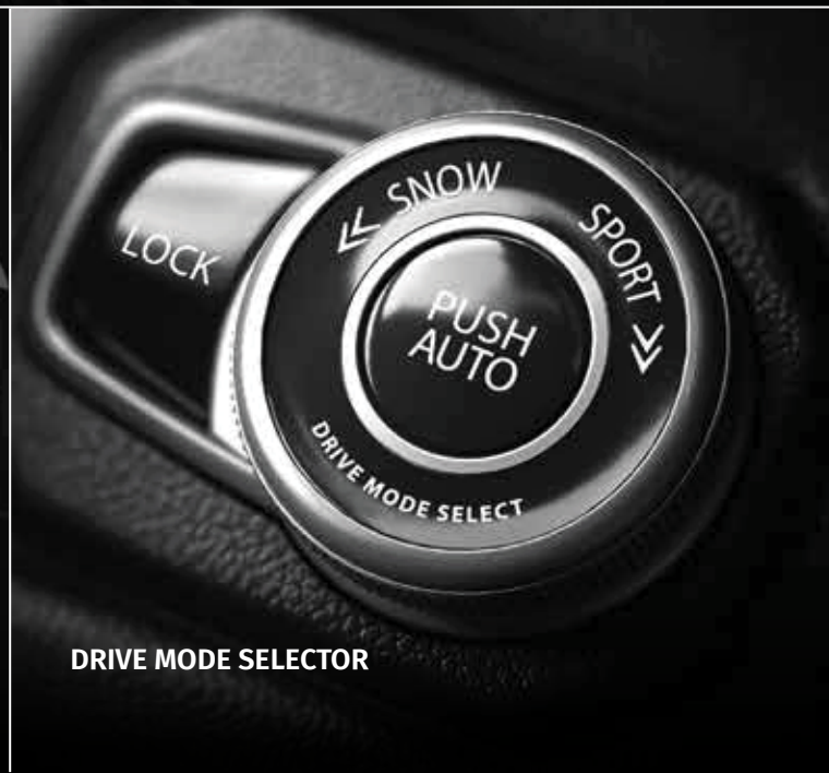
DRIVE MODE SELECTOR