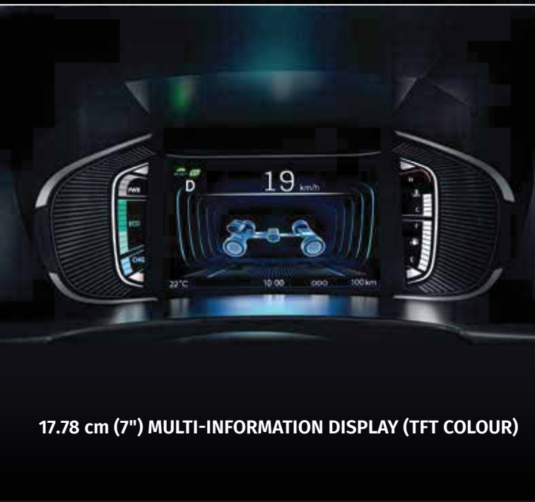
17.78 cm (7") MULTI-INFORMATION DISPLAY (TFT COLOUR)