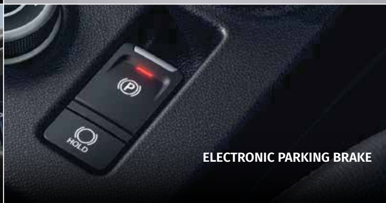
ELECTRONIC PARKING BRAKE