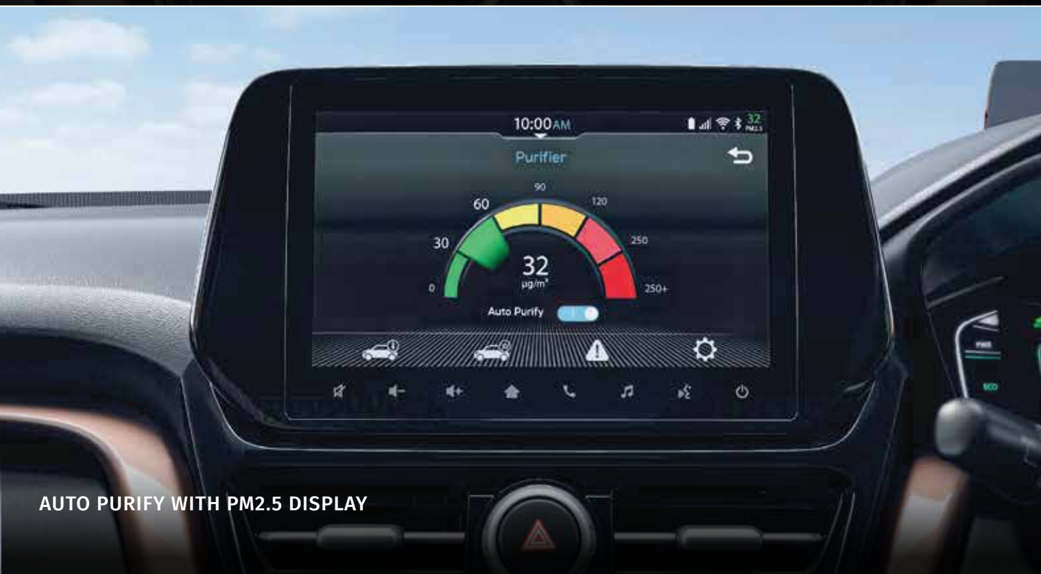
AUTO PURIFY WITH PM2.5 DISPLAY