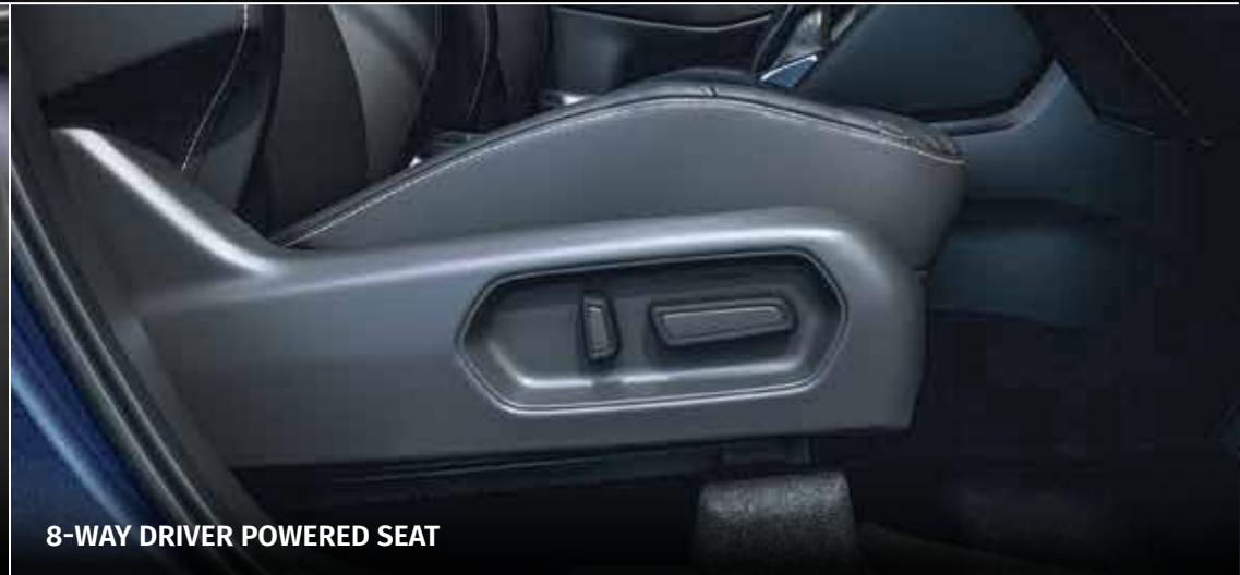
8-WAY DRIVER POWERED SEAT