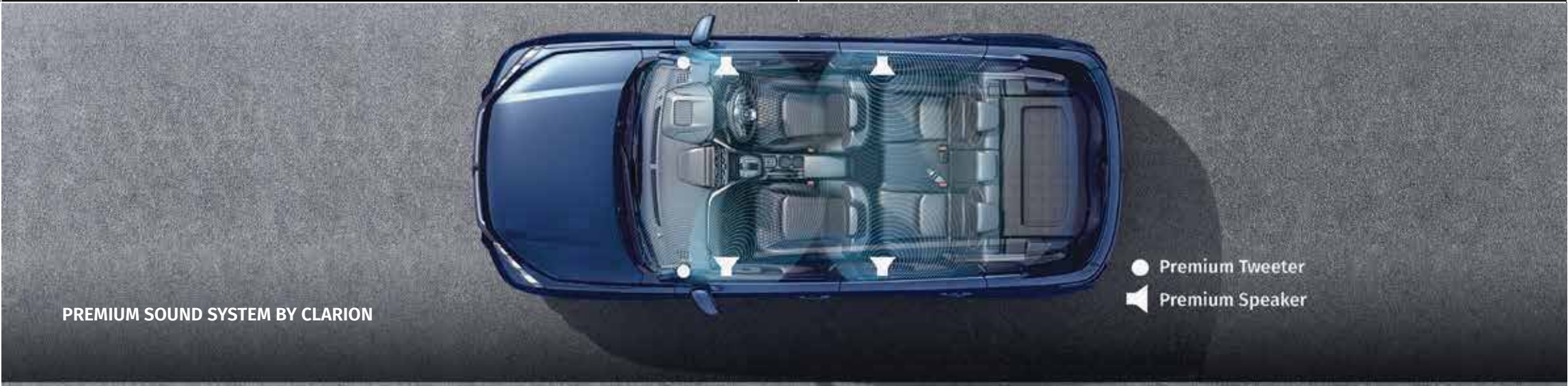
PREMIUM SOUND SYSTEM BY CLARION