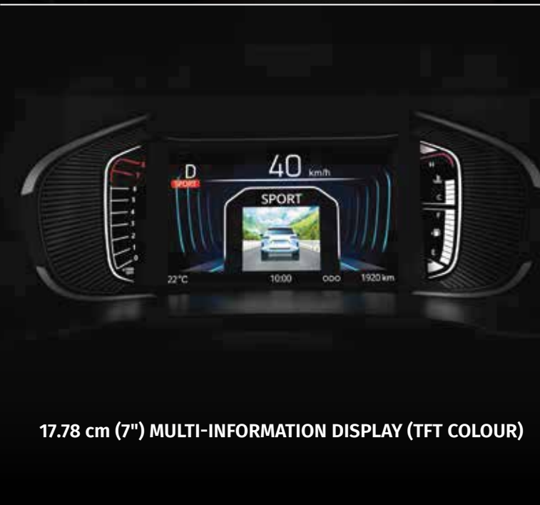
17.8 cm (7") MULTI-INFORMATION DISPLAY (TFT COLOUR)