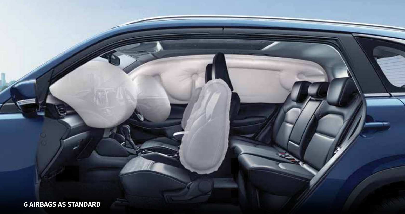
6 AIRBAGS AS STANDARD