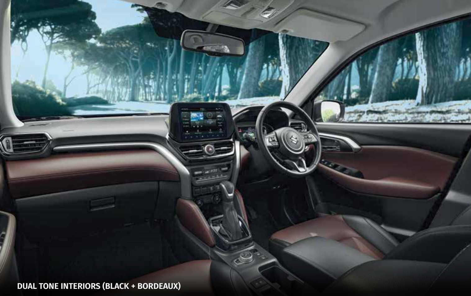
DUAL TONE INTERIORS (BLACK + BORDEAUX)