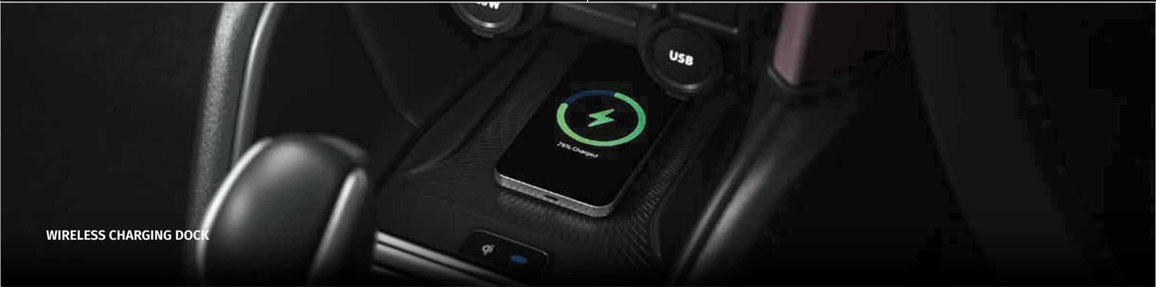
WIRELESS CHARGING DOCK