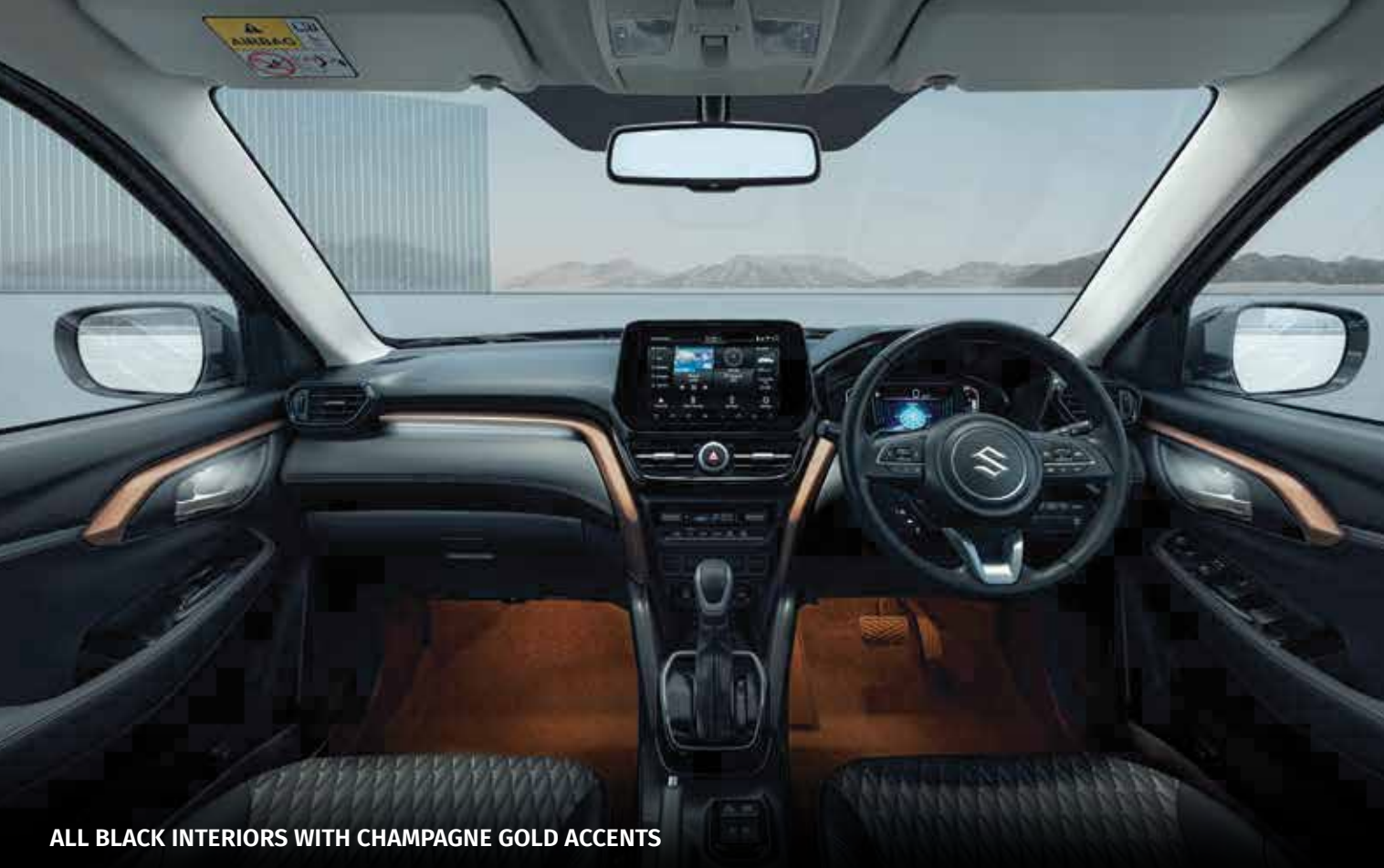
ALL BLACK INTERIORS WITH CHAMPAGNE GOLD ACCENTS