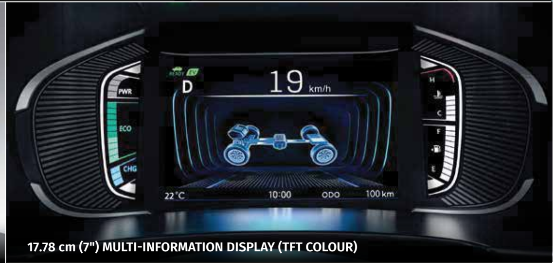
17.78 cm (7") MULTI-INFORMATION DISPLAY (TFT COLOUR)