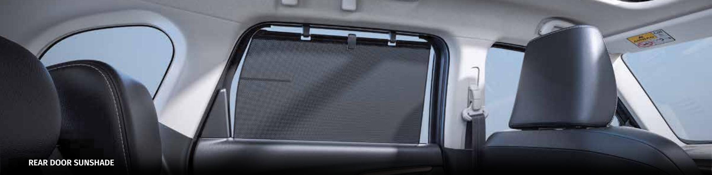
REAR DOOR SUNSHADE