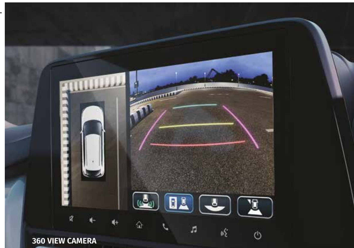
360 VIEW CAMERA