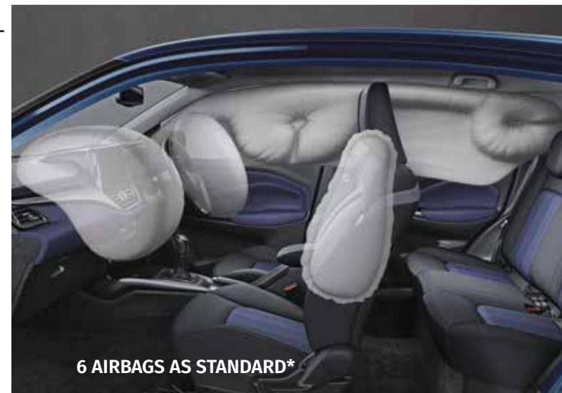
6 AIRBAGS AS STANDARD*