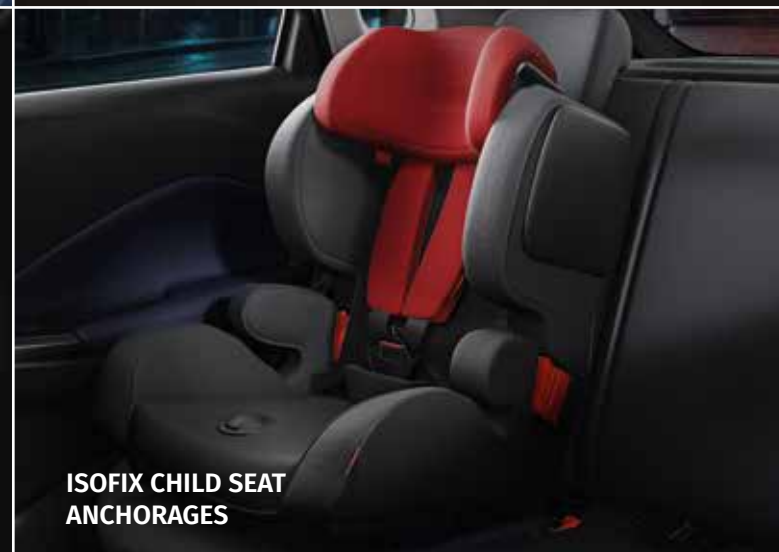
ISOFIX CHILD SEAT ANCHORAGES