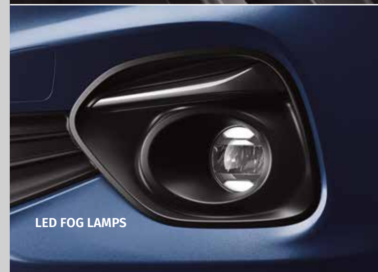
LED FOG LAMPS