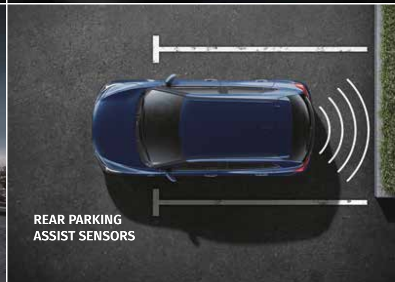
REAR PARKING ASSIST SENSORS