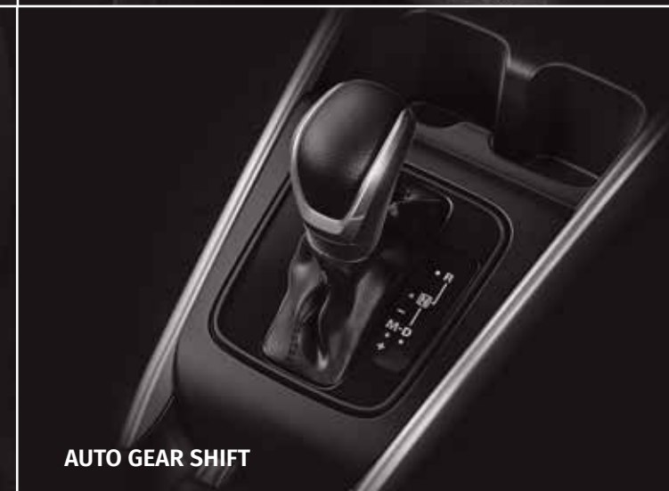
AUTO GEAR SHIFT