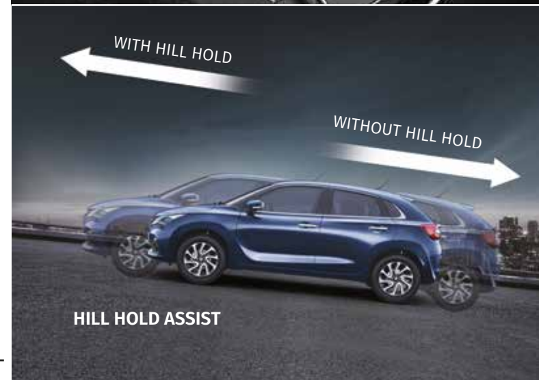
HILL HOLD ASSIST