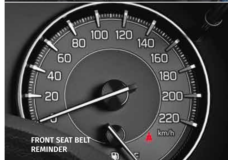
FRONT SEAT BELT REINDER