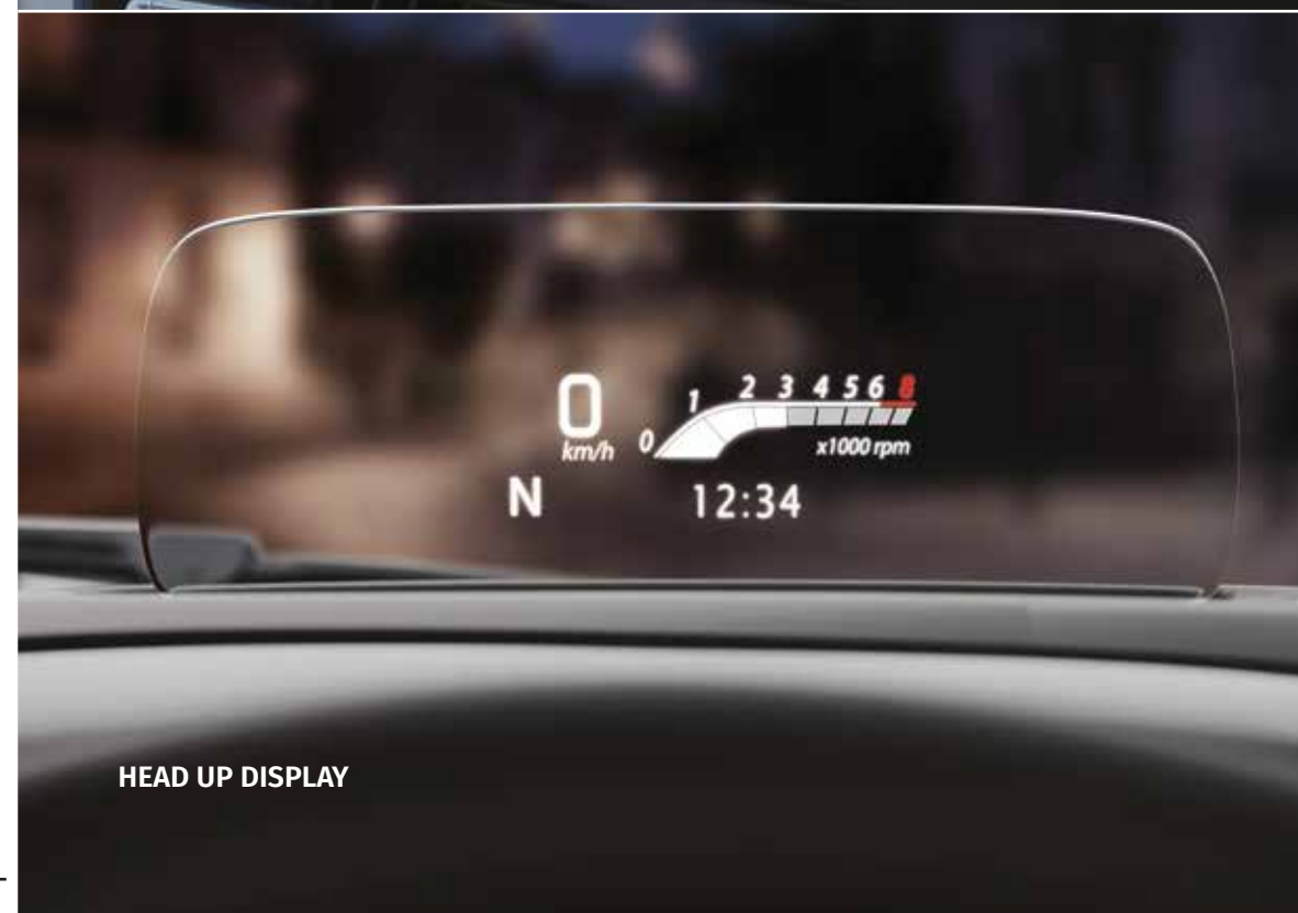
HEAD UP DISPLAY