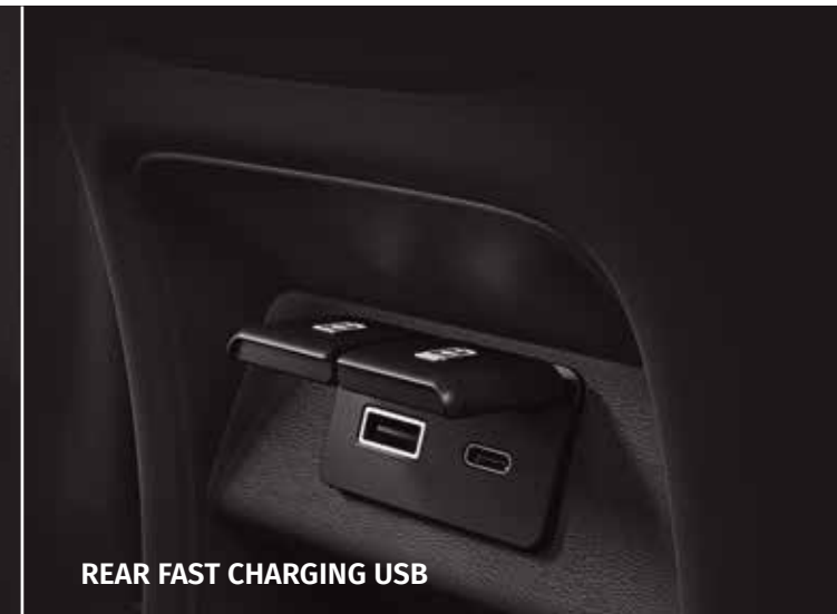
REAR FAST CHARGING USB